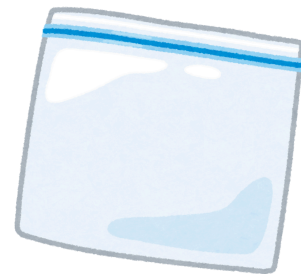
ZIPLOC BAGS (GALLON-SIZED)