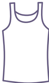
UNDERSHIRTS (ADULT SIZES)