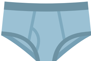
UNDERWEAR (ADULT SIZES)